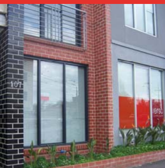
Above: Verso is now at 107 and 109 Fergie Street

Verso staff are comfortably settling into new surroundings after an office expansion in July this year. The staged move into the new office space right next door went smoothly! The Verso IT Team designed and installed the new phone system and took the opportunity to upgrade the server seamlessly and with admirable ease.